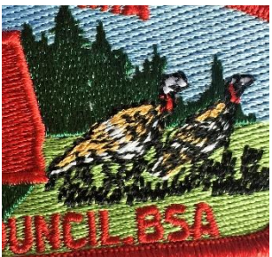
S7c Background Detail